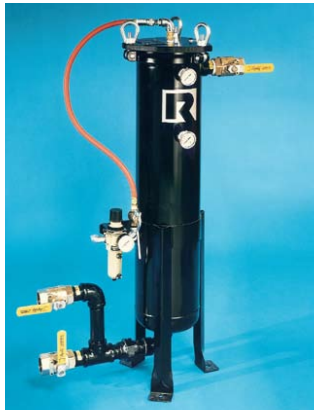
Manually-controlled backwashing filter housing